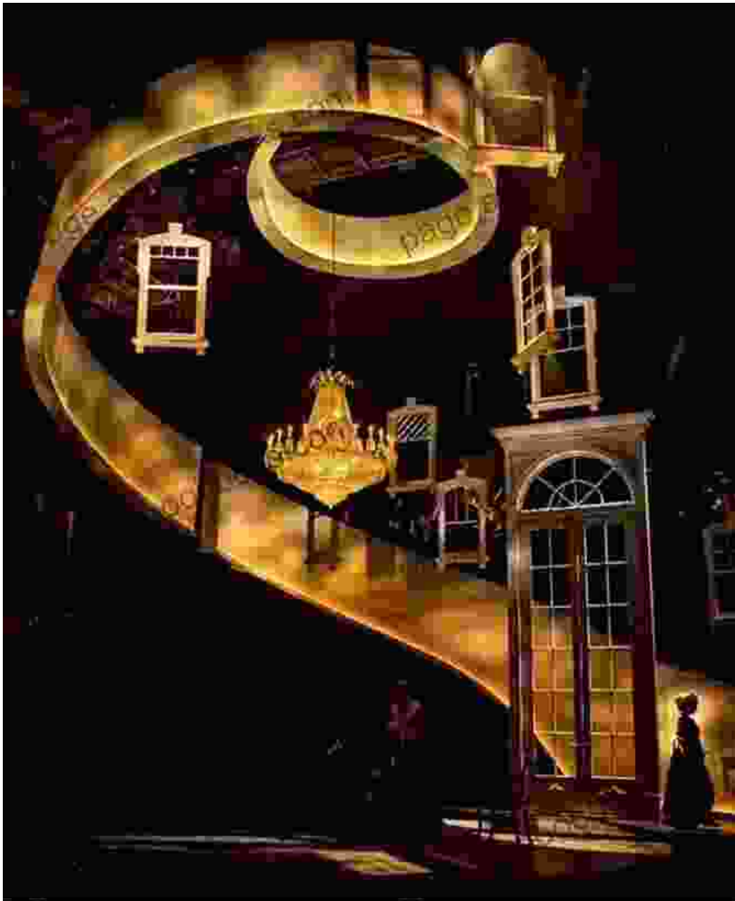
The powerful Prospero and his innocent daughter Miranda in "The Tempest"

As the shipwrecked travelers find themselves entangled in Prospero's intricate web of illusions, the play explores themes of power, redemption, and the transformative nature of forgiveness. With its cast of compelling characters, including the innocent Miranda, the mischievous Ariel, and the enigmatic Caliban, "The Tempest" transports the audience to a surreal and enchanting world, where the boundaries between reality and illusion blur.