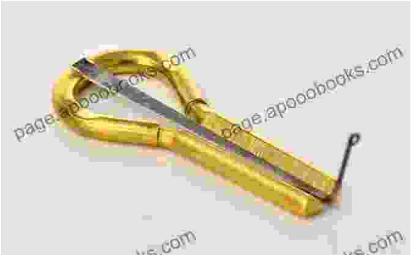
Image Description: A stunning photograph of a Jew's harp, exquisitely crafted with intricate engravings and designs. The image showcases the beauty and craftsmanship of the instrument, highlighting its historical and cultural significance.