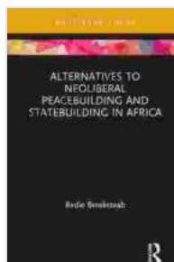
Image alt: Cover image of the book "Alternatives To Neoliberal Peacebuilding And Statebuilding In Africa" by Routledge featuring a map of Africa and the title in bold letters.