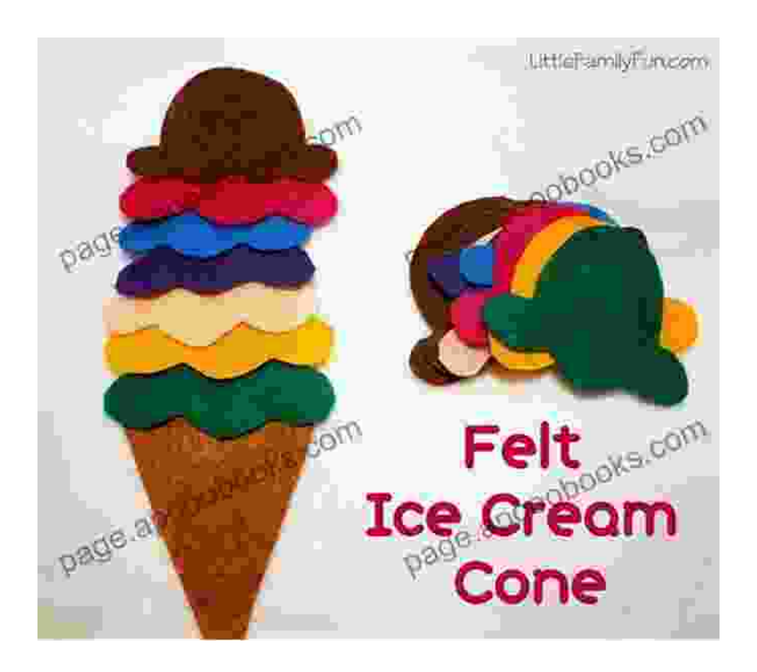
Step 4: Adding Toppings and Embellishments

For added stability, you can fill the inside of the cone with poly-fil or stuffing material to give it a plump and realistic appearance.