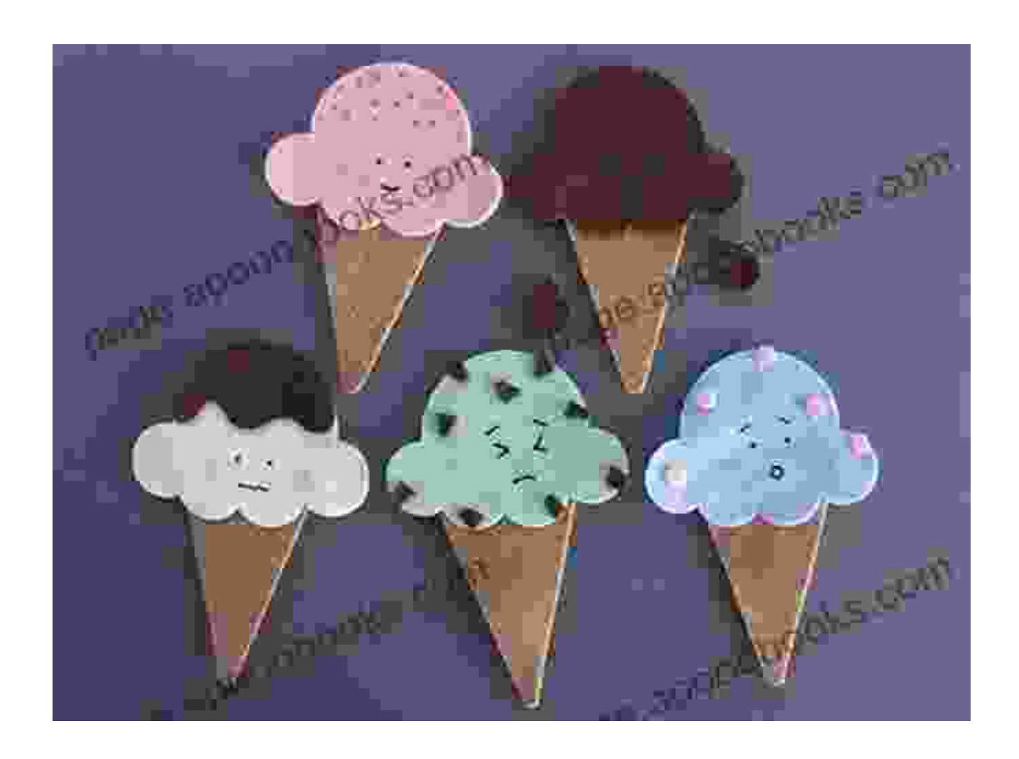
Step 4: Adding Toppings and Embellishments

You can also add beads, sequins, or embroidery thread to create additional details and textures. Experiment with various combinations to create a masterpiece that reflects your unique style and creativity.