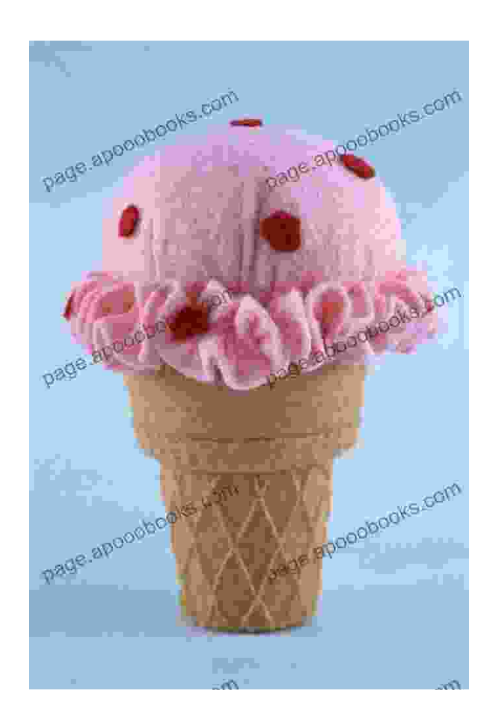
Step 2: Crafting the Felt Cone