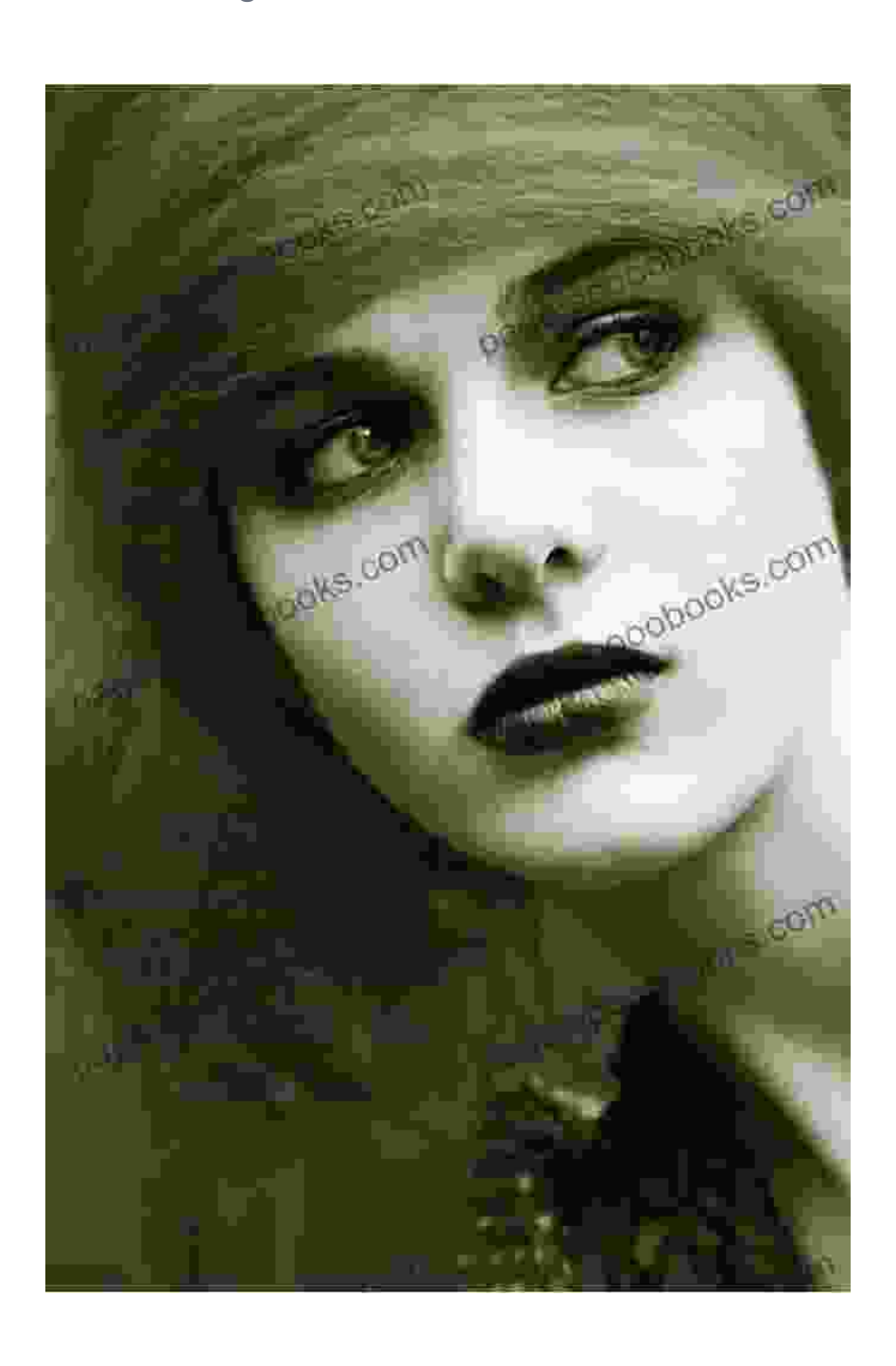
Unraveling the Mysteries of the Past

The author, with deft craftsmanship, paints a vivid and unsettling atmosphere that permeates every page. The eerie stillness of a secluded mansion, the unsettling whisper of the wind, and the ominous glow of sepia-toned photographs create a palpable sense of dread that grips the reader and refuses to let go.