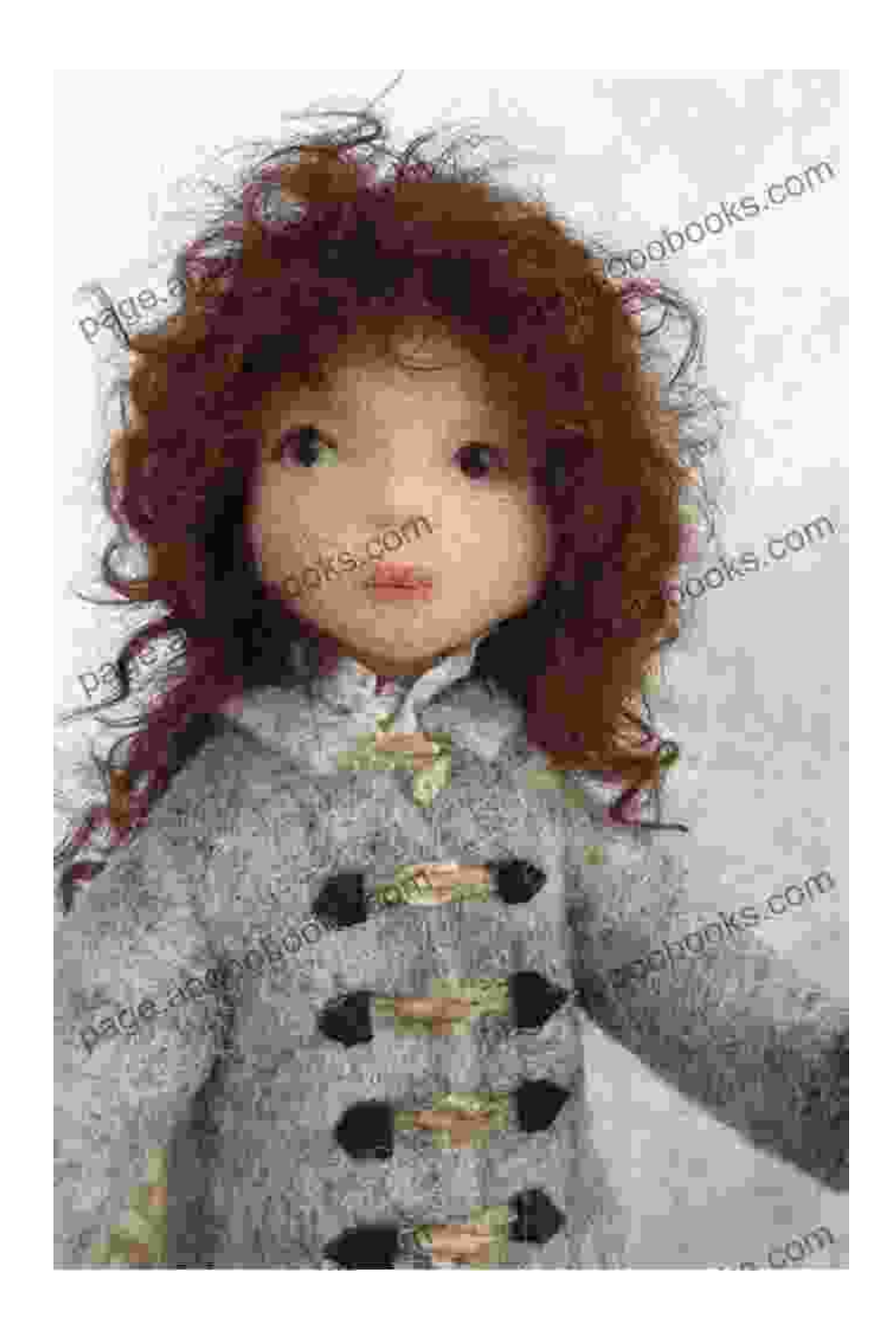
Inspiring Needle Felted Character Dolls

Immerse yourself in a gallery of breathtaking needle felted character dolls, showcasing the limitless possibilities of this captivating craft. Discover a world of imagination, creativity, and artistic expression as you marvel at the masterpieces created by fellow enthusiasts and renowned artists.