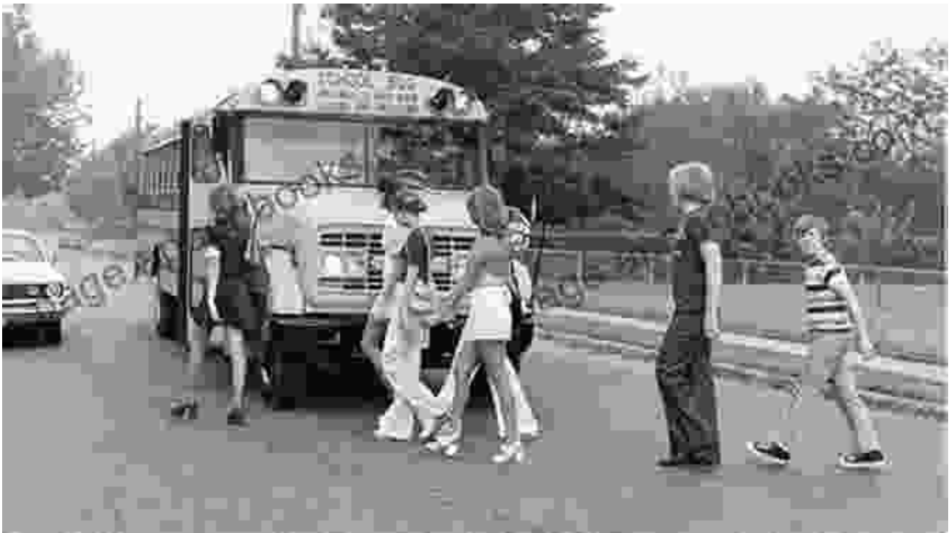
Cherry Hill High School: A Hub of Education and Community

Discover the tales of early settlers, immigrants, and civic leaders who played pivotal roles in the town's growth and development. Learn about the challenges and triumphs they faced, and the legacy they have left behind.