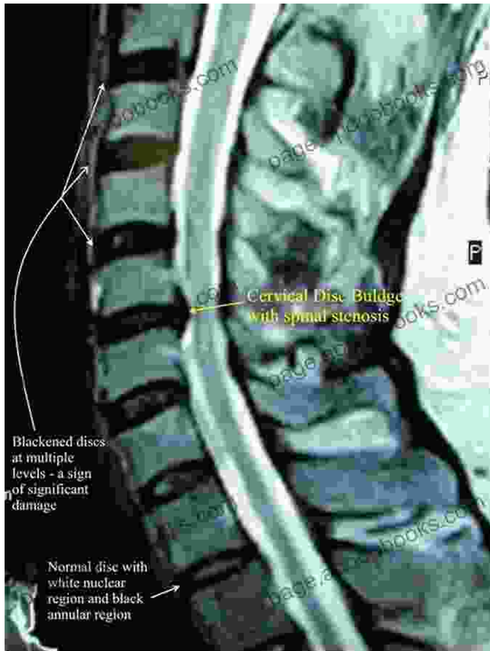
Figure 2: Cervical Degenerative Disc Disease