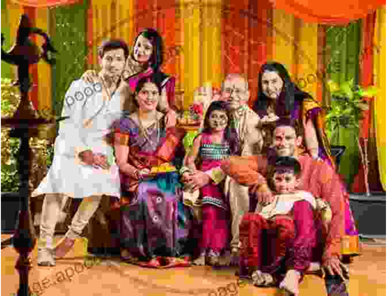
A warm welcome in India