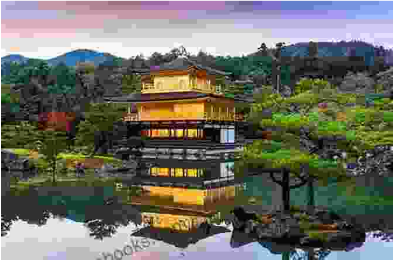
Tranquil temples in Kyoto